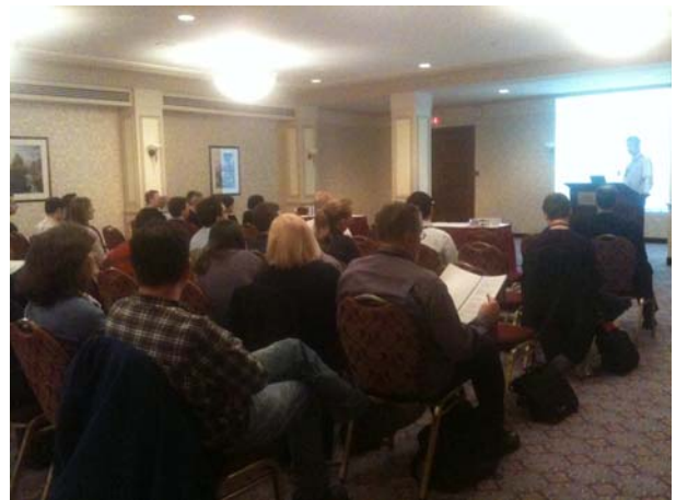
Participants at a lecture during the CLSRN / SOLE Meetings in Vancouver: April 29 - 30, 2011.